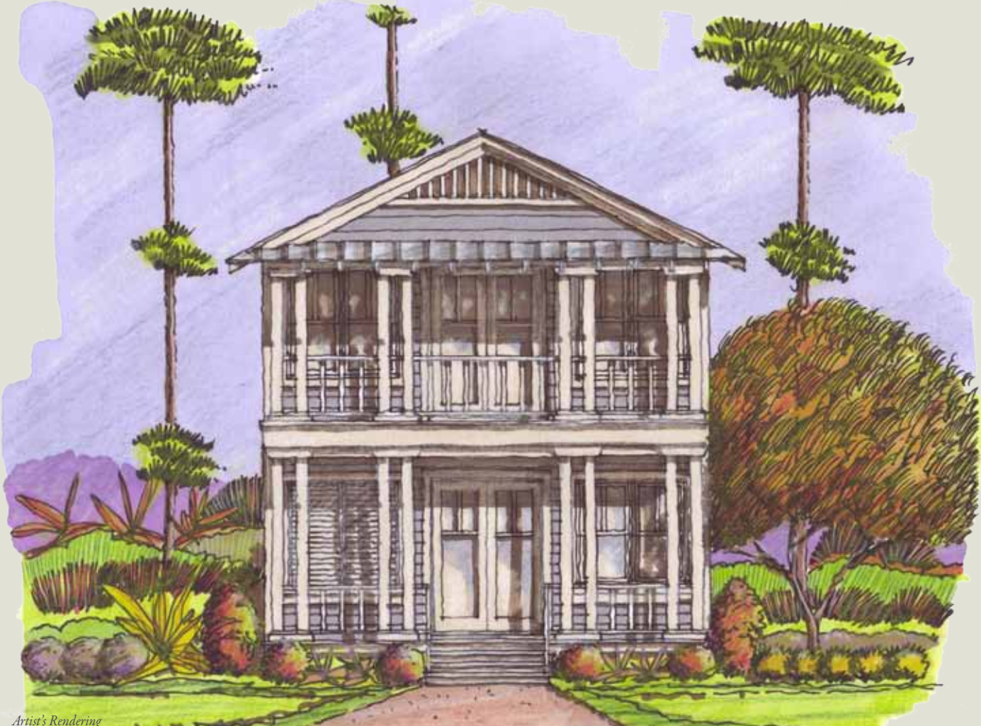
2 OWNER'S SUITES, BEDROOM, 3½ BATHS, BUNK ROOM, DAY ROOM, OWNER'S LOCK-OUT