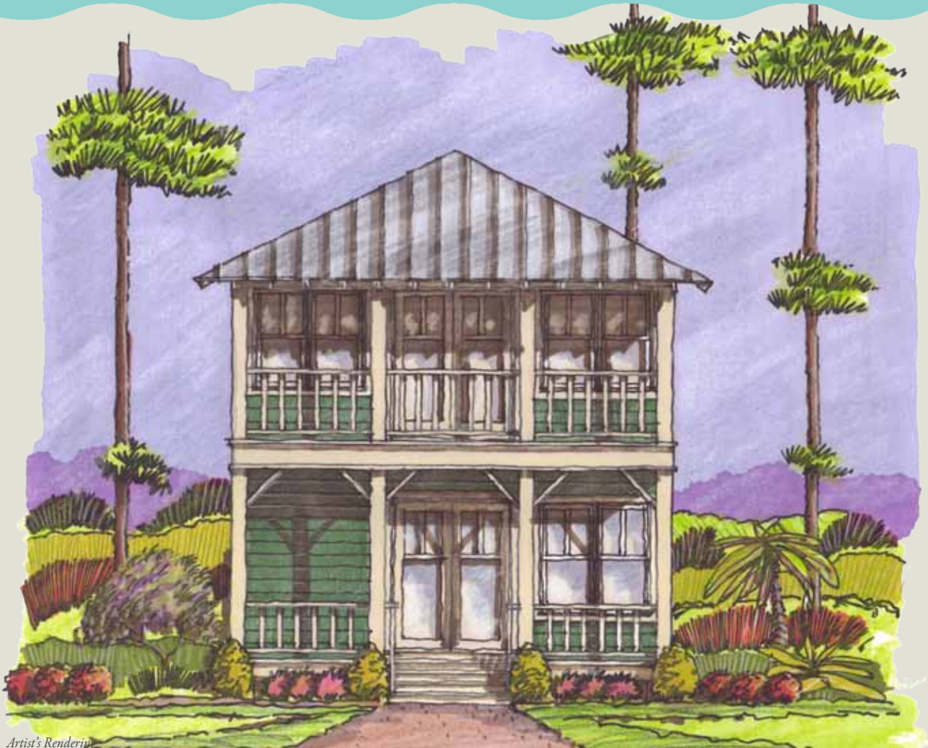
2 OWNER'S SUITES, BEDROOM, 3½ BATHS, BUNK ROOM, DAY ROOM, OWNER'S LOCK-OUT